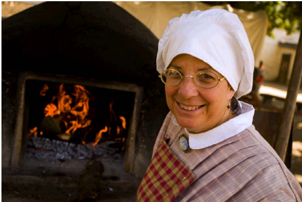
Living history characterizations are powerful program tools.