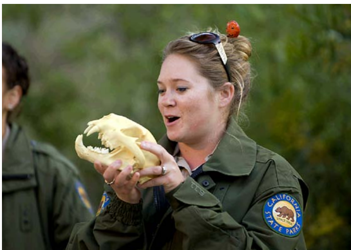
Props help visitors connect with your story.

If the object you are planning to pass around is expendable, have several to pass, not just one. Starting an object in the front row and expecting it to flow through the audience in a timely fashion does not work. If it is a large, fragile, precious, or dangerous object, make sure you explain the finer details and do not pass it around. Consider using a graphic, a handout, an image of the item projected on a screen, or a larger-than-life model.